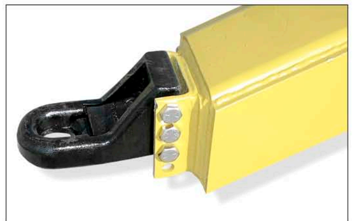
Heavy duty adjustable hitch for longer life.