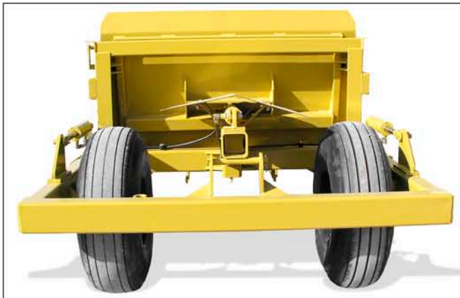
Reinforced gate and easy access to wheels.

Our design lets you see the cutting edge from the cab of your tractor.