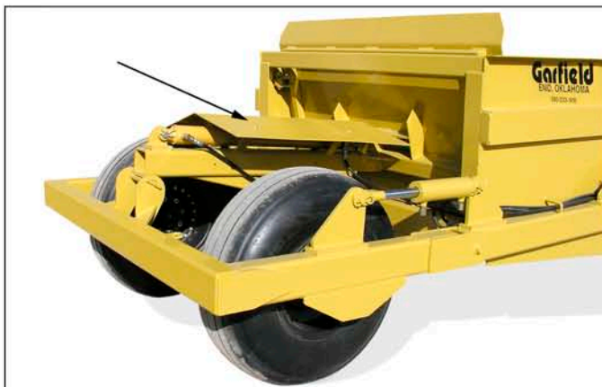
Safety Shield protects ejector cylinders, rails and guide rollers.